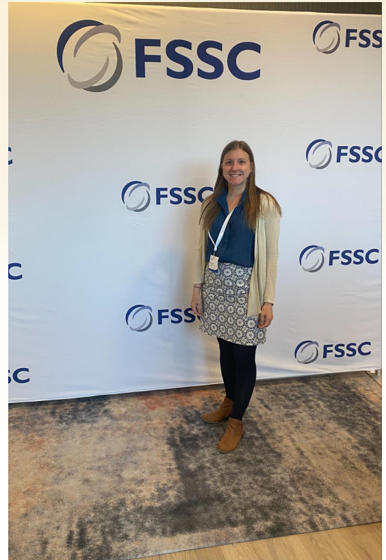
FSSC Insights 2025 in Amsterdam