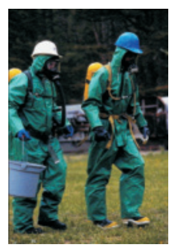
Chemicals that involve potentially excessive risks to humans and other life forms have now been regulated for decades.