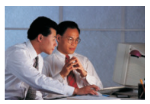
PJR is servicing the fast-growing demand for quality registration in the Pacific Rim... with offices in Japan, China, Thailand and more to come.

Simply put working with PJR is a valuable investment that helps our clients achieve continued revenue growth in today's flexible global economy.