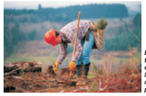
Because of the strong impact that logging can have upon ecosystems, today's logging and lumber companies realize they must implement proactive programs to minimize that impact.