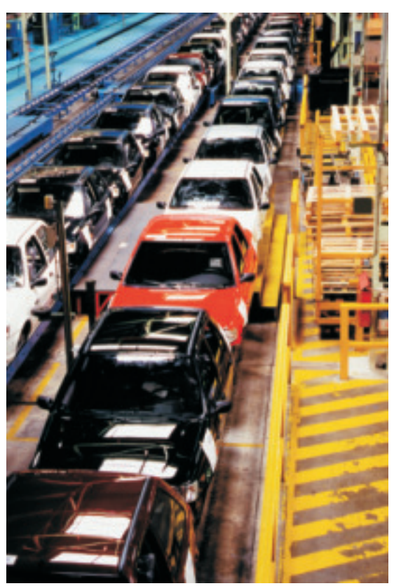
As an IATF recognized certification body for ISO/TS 16949, PJR has been instrumental in helping many small and medium-sized automotive suppliers meet the requirements of their customers.