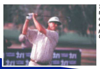
Today's athletes are seeking that competitive edge and they demand high-precision equipment. PJR has done its part by registering Eaton Corporation, maker of golf grips.

PJR is accredited to certify firms classified under EA 2, Mining and Quarrying. This sector includes everything from mining of metals, to quarrying of stone, to exploration and extraction of petroleum and