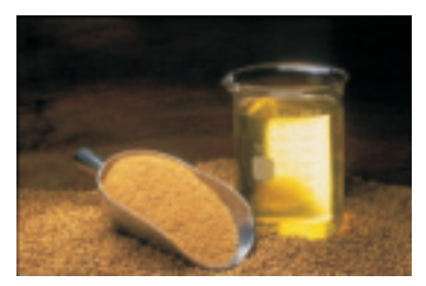
Soybean meal and soybean oil are two of the many agricultural products produced by Cargill de Mexico, a PJR client.

There is greater attention today to quality and food safety registration than ever before. Outbreaks of food allergies and e-coli have led to more public attention that has led to the establishment of ISO 22000 , a generic food safety management system standard.