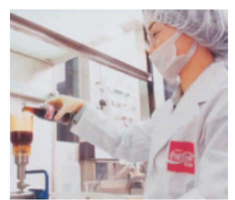
Quality control is taken very seriously at Coca-Cola Central Japan Co., Ltd. PJR has certified multiple sites of this client – one of the largest bottling groups in Japan – to EMS, QMS, or both.