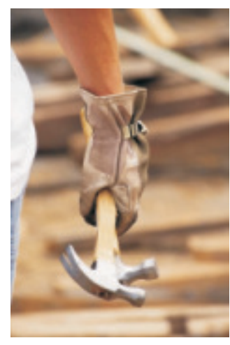
PJR certifies companies performing carpentry, masonry, plumbing, electricity, HVAC and other skilled trades.