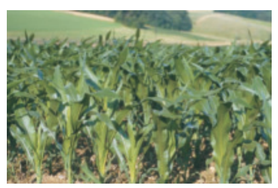
ISO 9000 has helped to move the family farm from agriculture to a more profitable agribusiness.